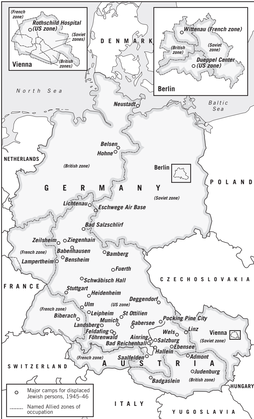
Main DP camps